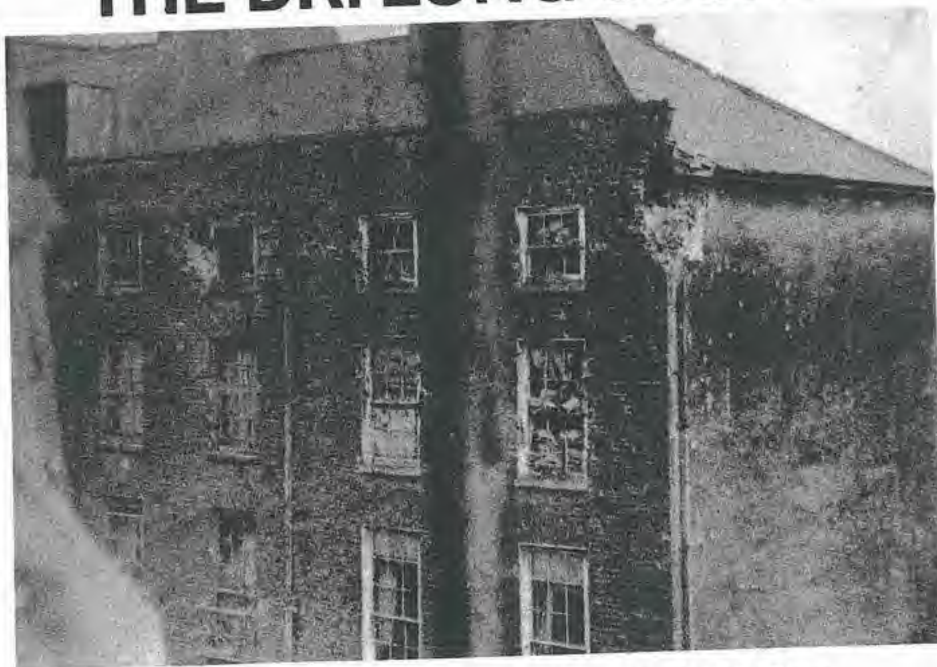
The Medical Mission during the Civil War